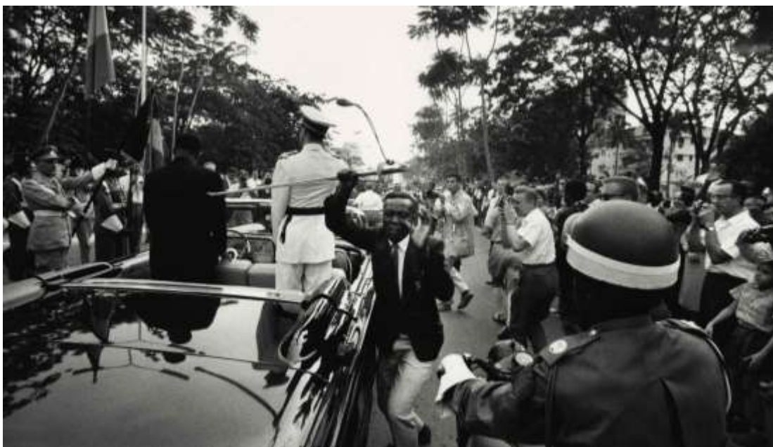
Leopoldville, Belgisch-Kongo (1960)