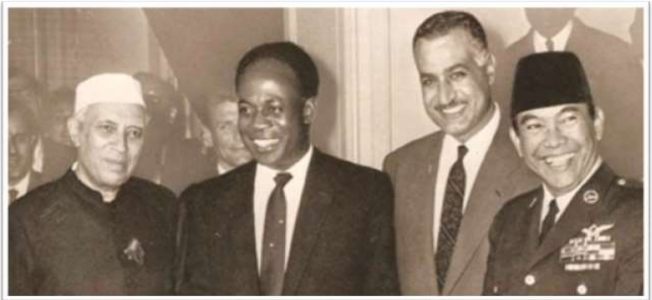
Mission accomplished? — Postkoloniale Staatsoberhäupter der ersten Generation im Jahre 1961: Nehru (Indien), Nkrumah (Ghana), Nasser (Ägypten) und Sukarno (Indonesien).