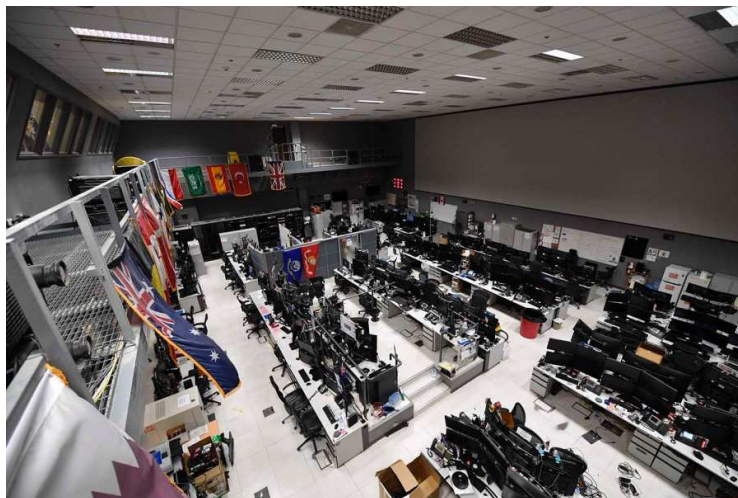
An empty Combined Air And Space Operations Center at Al Udeid Air Base on September 28, 2019.

Personnel at Shaw Air Force Base in South Carolina temporarily took over from the Combined Air Operations Center (CAOC) at Al Udeid in what amounts to a “dress rehearsal,” but which some surmise may be a harbinger of the US pivoting away from the Mideast. 2