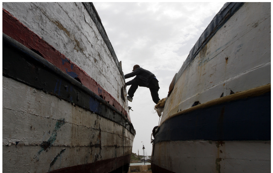
A Tunisian migrant amongst fishing boats used by migrants from North Africa to reach the southern Italian island of Lampedusa, March 2011.

Besides reinforcing external border management capacities, the EU has also attempted to impede irregular migrants before they reach its territory. The EU's border agency, Frontex, plays a key role in this respect. It carries out interception operations not only with EU and non-EU Schengen states, but also with third coun-