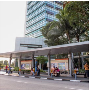
A NUS shuttle bus D2

At University Town, proceed to the CREATE Tower (across from the Korean restaurant), take the escalator to level 2. At the security counter, exchange a photo identification card for a visitor pass. Take the lift to our reception desk at level 6.