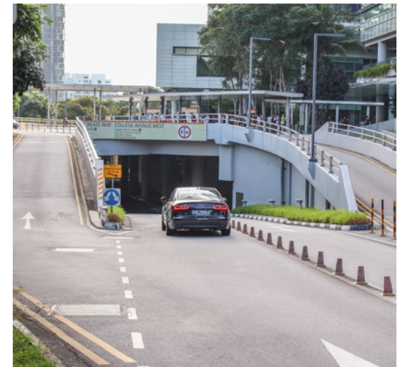
B Ramp down to the car park