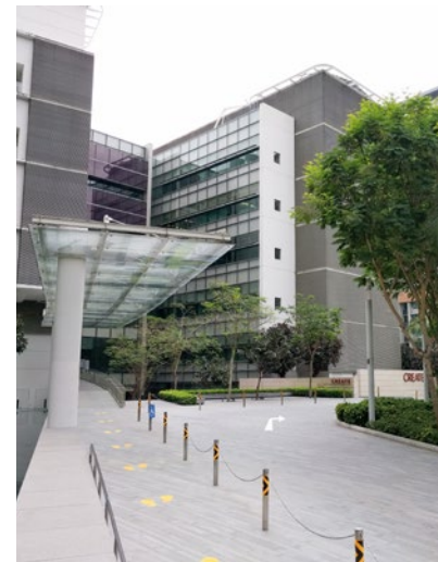
A Pick-up / Drop-off & Taxi stand

At the security counter, exchange a photo identification card for a visitor pass. Take the lift to our reception desk at level 6.