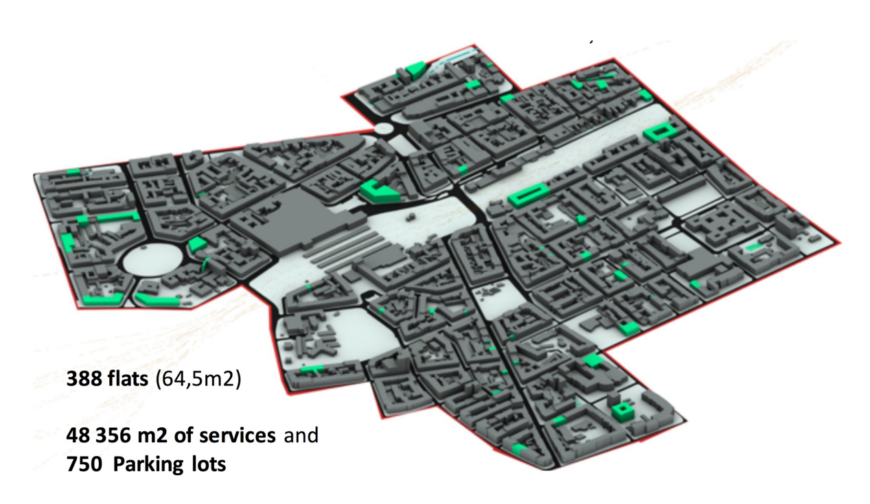
Fig. 7 Katowice downtown Co-housing potential study