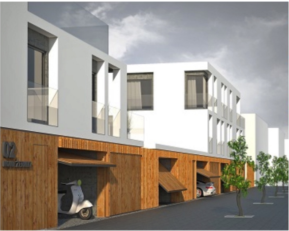
Fig. 5 Nowe Żerniki Cohousing, building no 1. Plot no 62/11. Concept design, author: Pracownia Architektoniczna CREO Project (Piotr Marek, Bartosz Szczepański, Bartosz Żmuda), Retrieved form: official municipality data, www.wroclaw.pl, Accesse June 2016