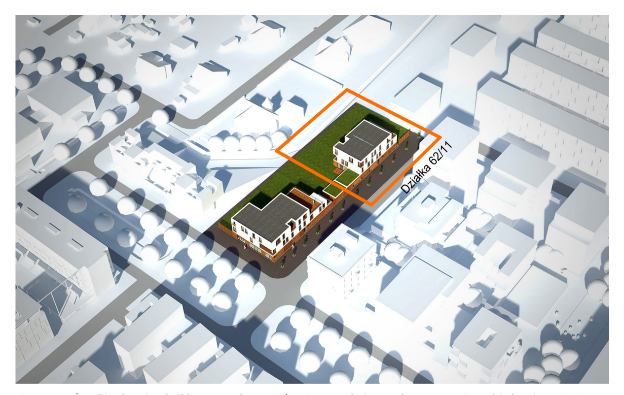
Fig. 4 Nowe Żerniki Cohousing, building no 1. Plot no 62/11. Concept design, Author: Pracownia Architektoniczna CREO Project (Piotr Marek, Bartosz Szczepański, Bartosz Żmuda), Retrieved form: official municipality data, www.wroclaw.pl, Accessed June 2016