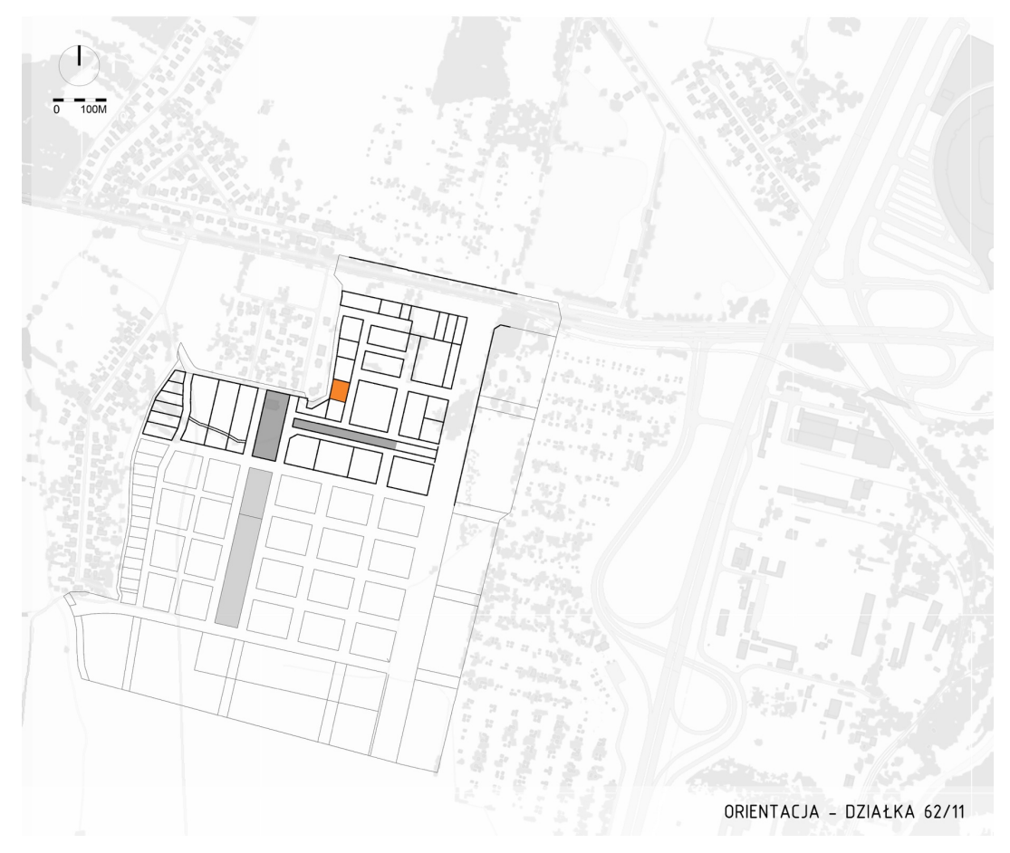
Fig. 3 Nowe Żerniki Cohousing, building no 1. Plot no 62/11, Retrieved form: official municipality data, www.wroclaw.pl,