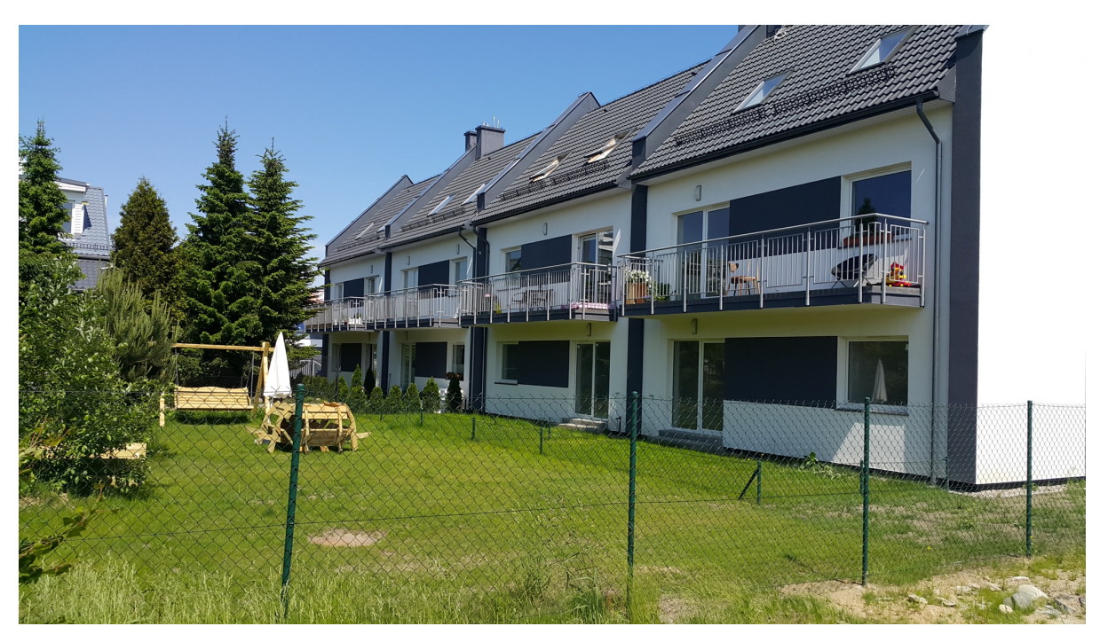
Fig. 6 Co-housing "Pomorze" - rear view, 1st assembly, Courtesy of Roman Paczkowski