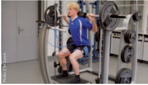
Synthetic exercise maximises endurance and strength.