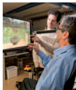
Senility: the Cognimat helps treat memory loss.

to use their arms again, using a virtual training programme to practise everyday skills such as cooking. In clinical studies, ARMin has produced excellent results and is set to enter the market very soon. A more recent project has started researching a robot for people suffering from Alzheimer's disease: the Cognimat enables memory and cognitive functions to be trained in a fun and efficient way. It is being developed in close cooperation with hospital experts.